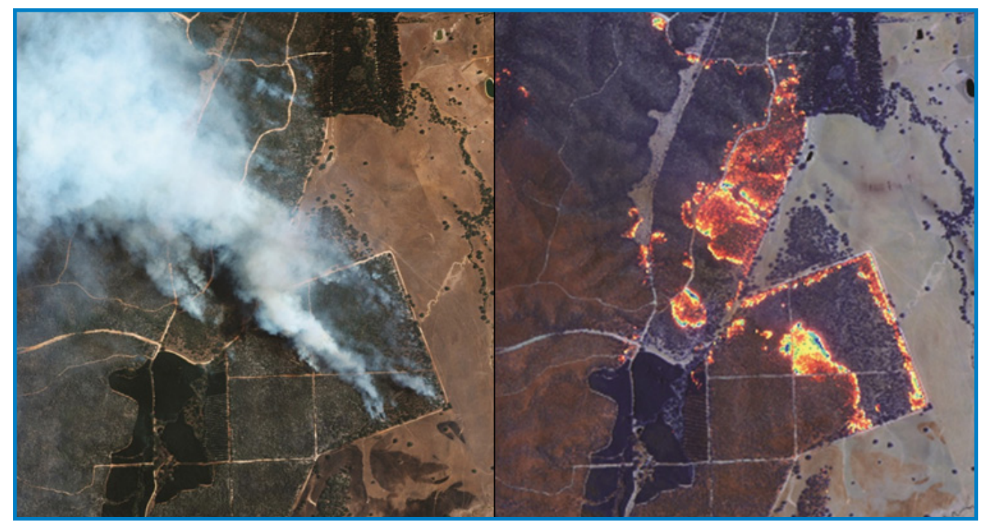
The above image shows how SWIR data can be used for thermal detection and to penetrate smoke and haze. The left image is the natural colour satellite image and the right image has had the SWIR spectural bands applied. As you can see, the smoke is gone and the areas affected by fire are clearly visible.

A critical factor in being able to respond to wildfires, is to have information about the location and severity in a timely manner. With the agility and spectral depth of WorldView-3, getting this information has never been easier. The unique SWIR bands not only penetrate smoke, allowing for a clear view of the ground, but they also pinpoint sites of active burning so that response efforts can be directed most efficiently.