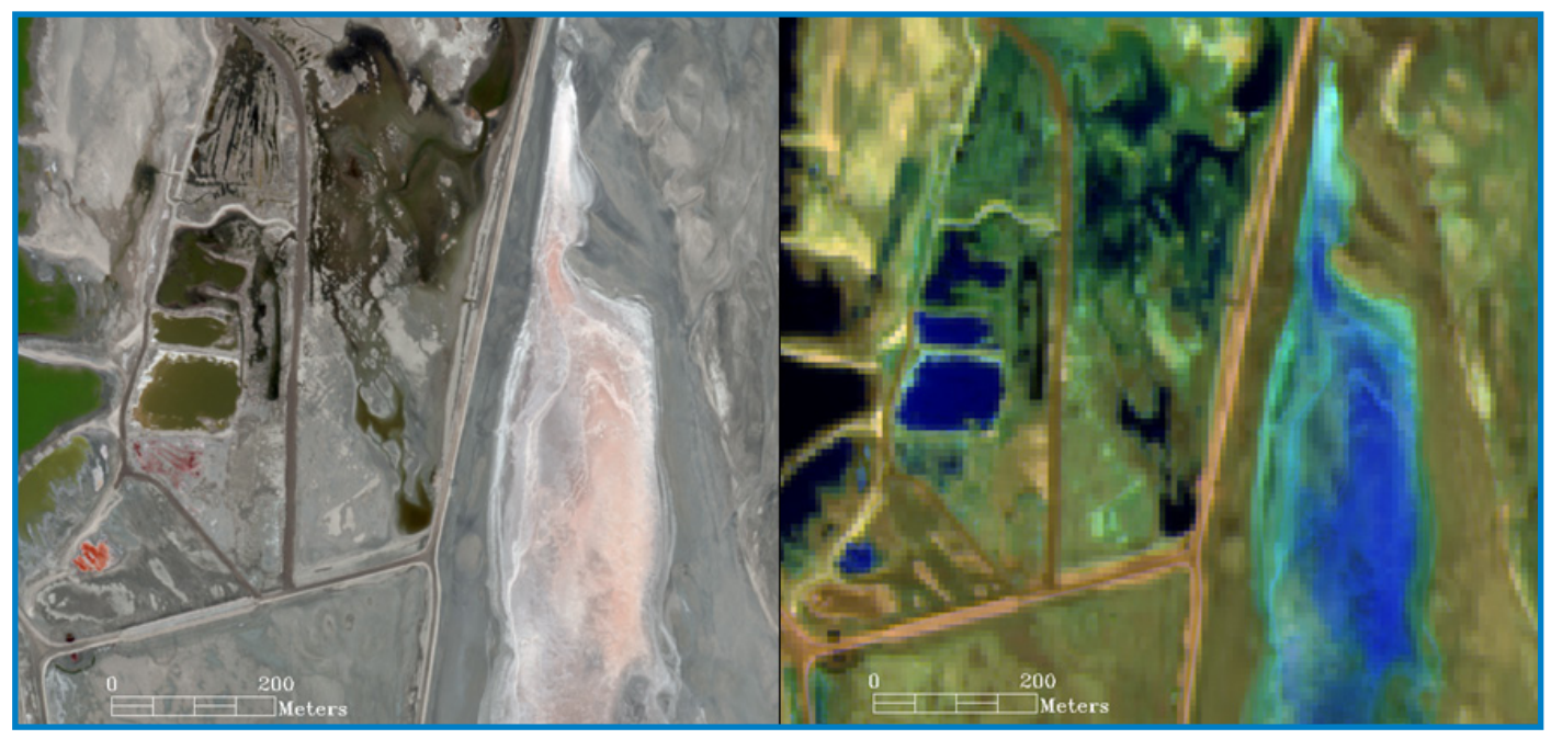
The above image shows how SWIR data can be used for soil moisture detection. The left image is the natural colour satellite image and the right image has had the SWIR spectural bands applied. The areas highlighted in blue shows the level of moisture present. The darker the shade, the more moisture. The areas highlighted in yellow indicate no moisture present.

One of the agricultural community's best management practices relates to how much post-harvest crop residue is left on a field. Crop residue preserves soil moisture and prevents soil erosion during rainy months. SWIR spectral bands can be used to map and quantify how much crop residue is left behind, predicting the soil quality for future crops.